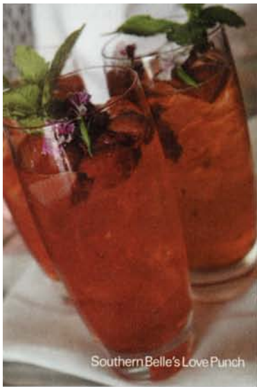
Southern Belle's Love Punch