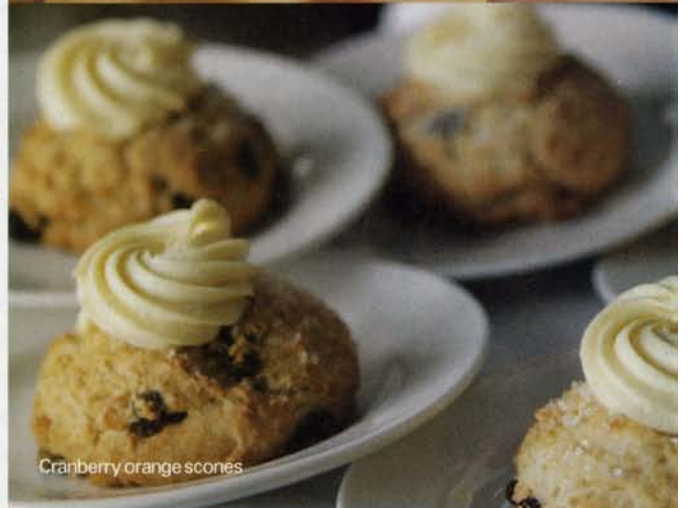
Cranberry orange scones