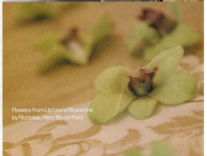
Flowers from Uptowne Blossoms by Nicholas, West Bloomfield