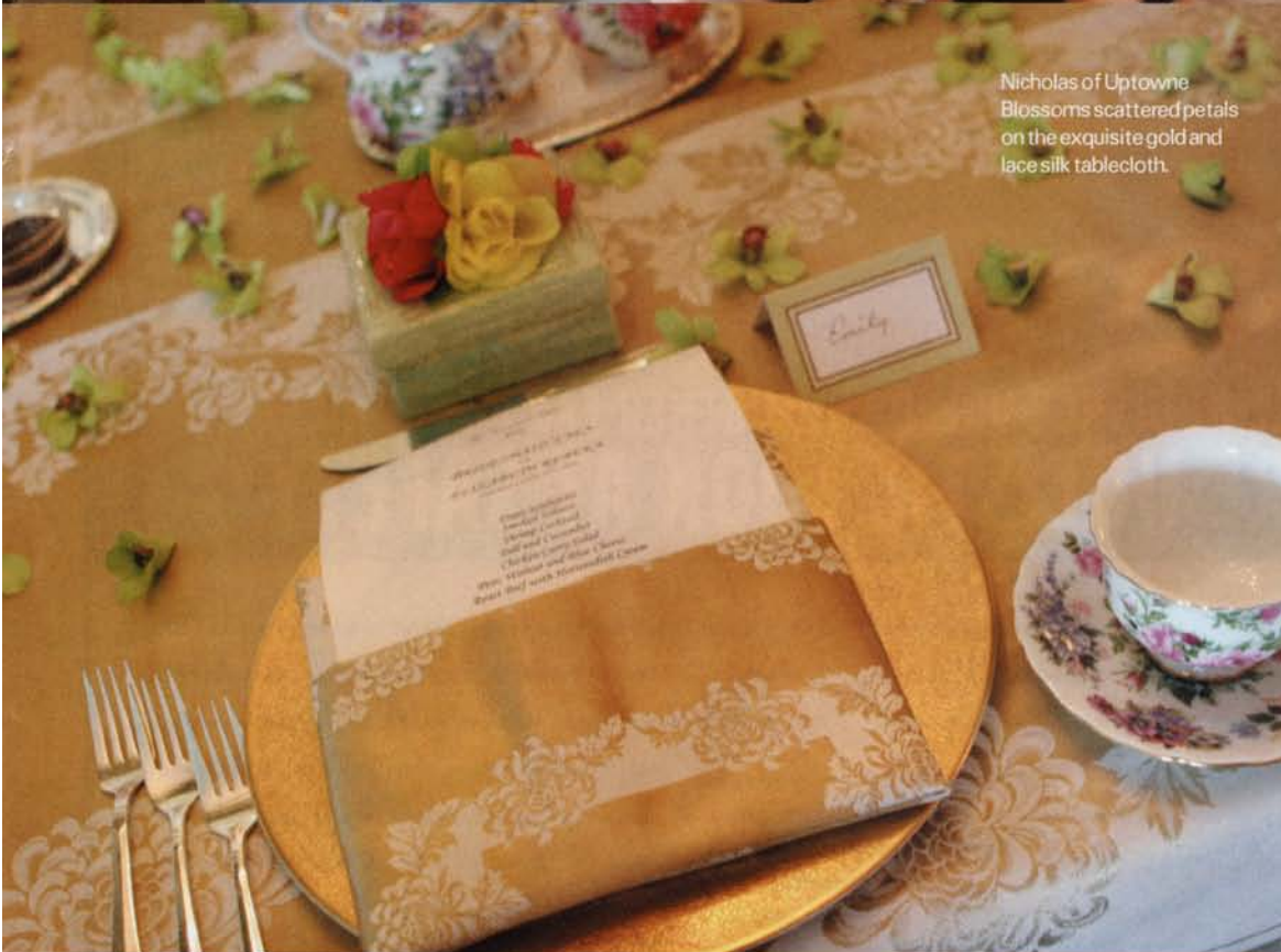
Nicholas of Uptowne Blossoms scattered petals on the exquisite gold and lace silk tablecloth.